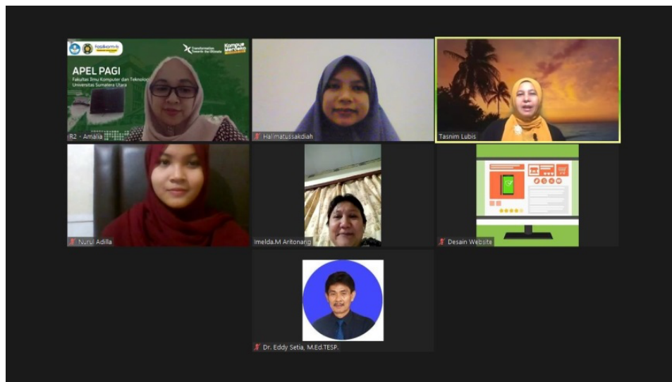
Figure 3. Discussion time ECP team and the owner of Quen Burger and Snack.

Based on discussions between the ECP team consisting of language and computerization fields, as well as business partners, a plan to create a sales profile display at the main location was prepared, the website name to be determined, the preparation of interesting texts, and product images. At the implementation stage, the name of the website and the displays that will be published on the website are known. Discussions of the ECP team and business partners were also partly conducted online due to the situation related to the security of both parties. Here is an image that was discussed offline and online.