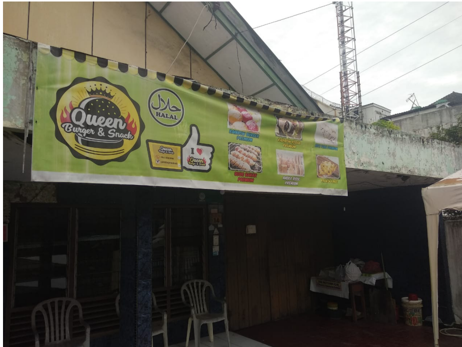
Figure 1. The location of Queen Burger and Snack business.

website design. Website design is the solution offered to answer the promotional needs of Queen Burger and Snack. The third stage is the creation of a website to promote the Queen Burger and Snack business. Website creation through discussions with Queen Burger and Snack owners using the ZOOM application. This is due to the COVID-19 pandemic situation so all activities are carried out virtually.